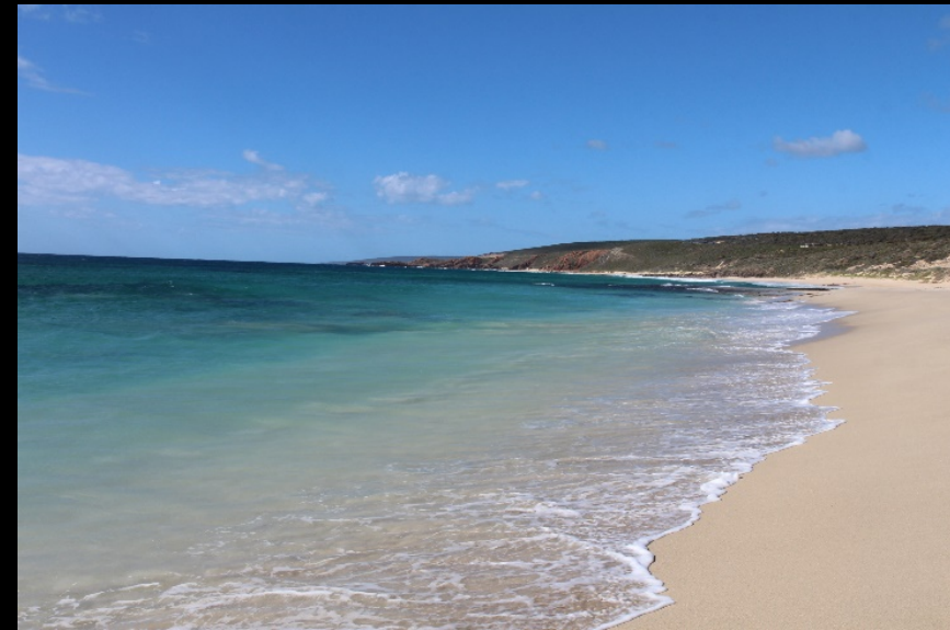
Leads to this Pristine, Secluded Stretch of Injidup Beach

There are over 20 iconic beaches a 15-30 minute drive away,,