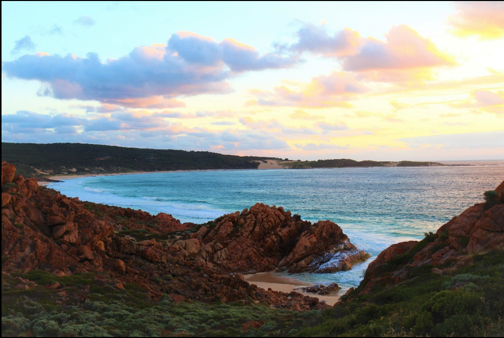
Pristine Beach & Coastline

Breathtaking 360° & Beachfront Views – Panoramic Sunset & Ocean Views