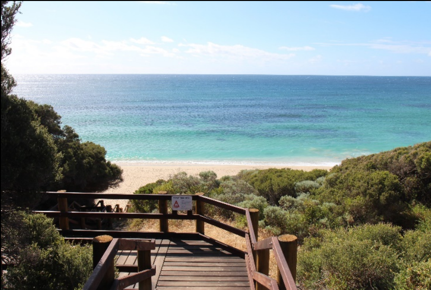
Beach Access blends with Nature

The block offers elevated ocean views and direct access to Injidup's white sand beach with calm turquoise waters on one end, and perfect surf on the other.