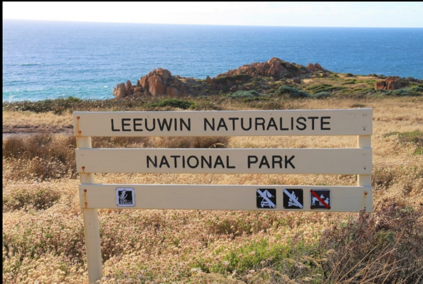
Bounded by National Coastal Parklands

The site is surrounded by protected National Forest and Coastline.