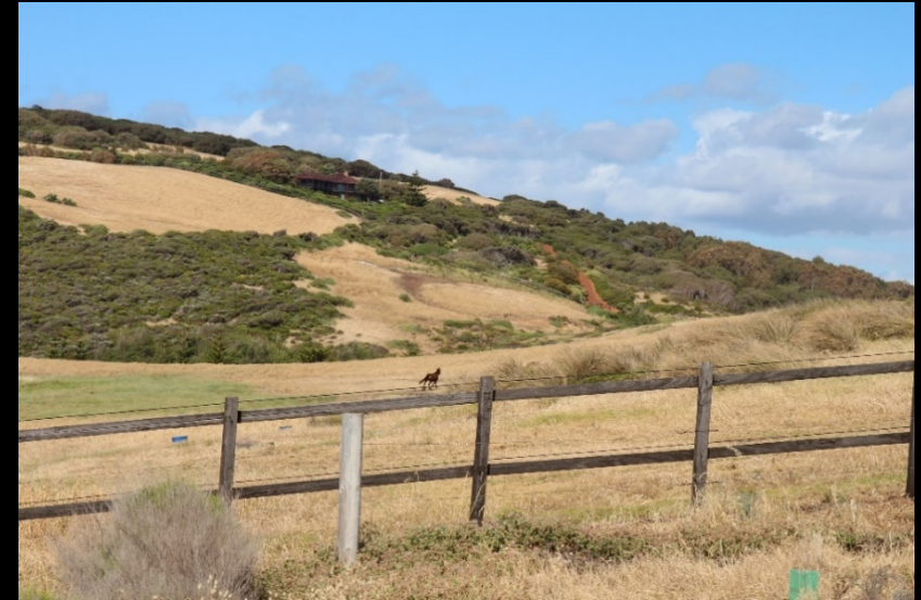
Neighbouring Hillside - Horse property

The region is ripe with fig, lemon, lime, orange, mandarin, avocado and olive trees.