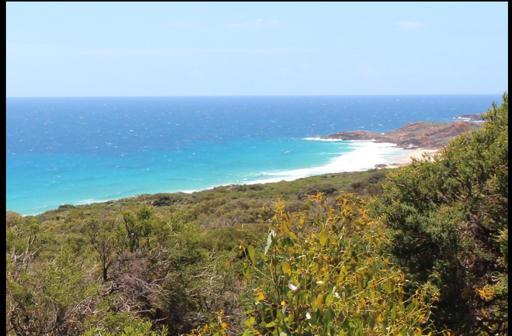
Land For Sale – by Owner